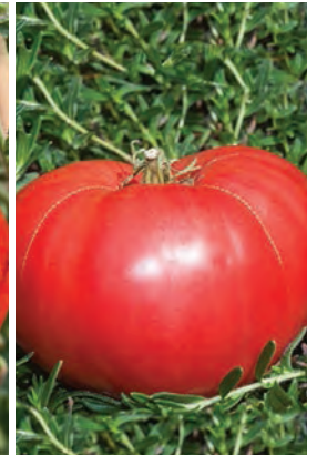
Mortgage Lifter (Estler's)