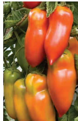
San Marzano (Redorta)